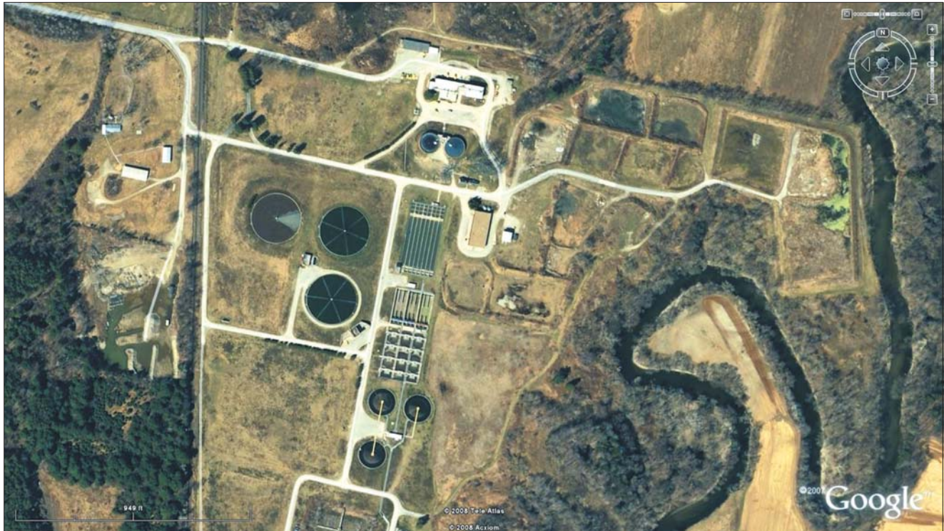
Aerial view of the Pittsfield, MA, wastewater treatment facility.

digester building, while mixing is accomplished by re-circulating compressed digester gas from the headspace of the primary digester to the bottom of the vessel through lances (see Figure 1). In the second stage of the anaerobic digestion there is no active mixing or heating of the sludge, but solids-liquid separation through quiescent settling of the sludge.