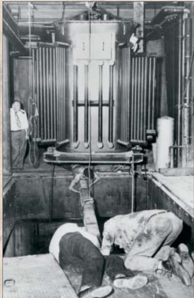
Electrical for the Detroit Windsor Tunnel being installed in 1929.