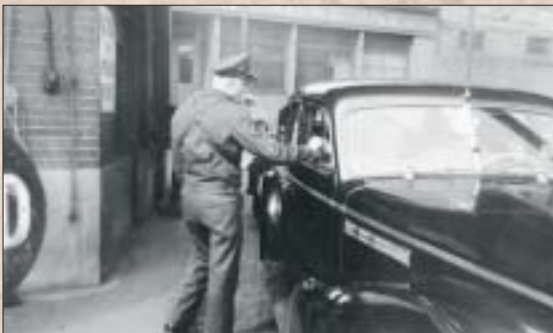
Toll collection has come a long way since the tunnel was opened in 1930.