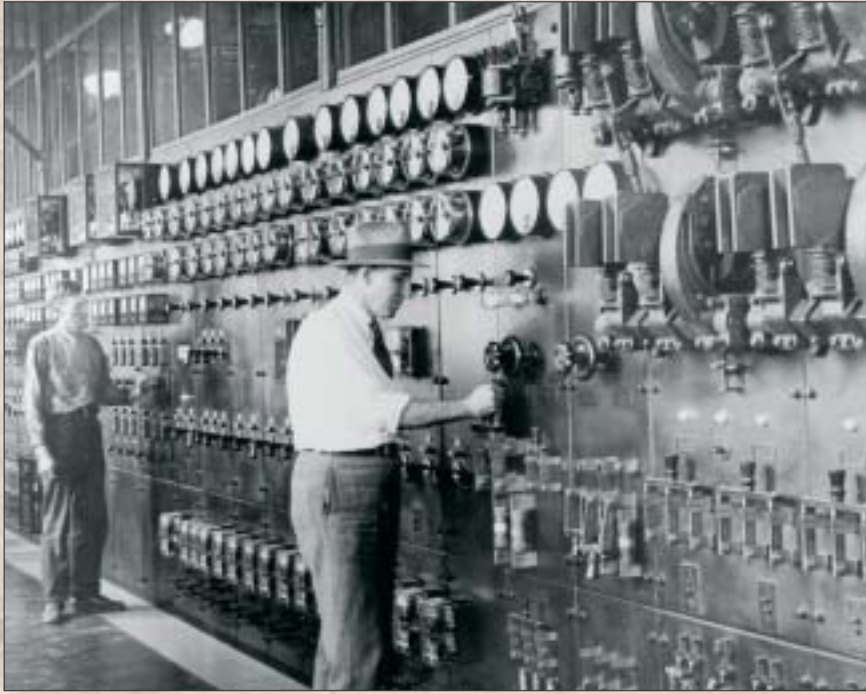
Controls for the Detroit Windsor Tunnel air supply equipment in 1930.

transformers for the new 4800, 5kV system.