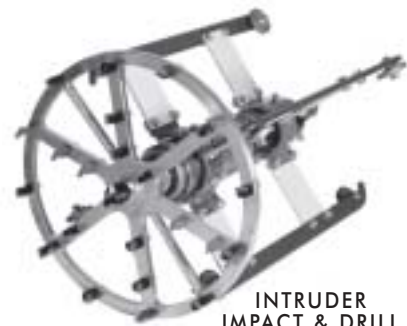
INTRUDER IMPACT & DRILL

Flow-Tek Corporation Safety Harbor, Florida