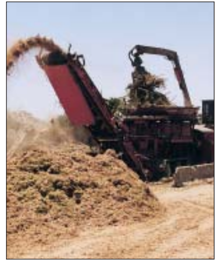
Having a pair of tub grinders now allows some auxiliary grinding in the area.

"No single piece of equipment can be held responsible or accountable for a program's success," he adds. "However, the performance we've gotten from the tub grinders has been everything the company promised and then some. More importantly, we've gotten excellent support for that equipment and because reducing downtime is as impor-