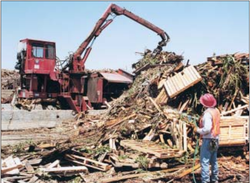
Large tub grinder generates product that is disposed of at a co-generation plant or used by landscapers and grading companies for erosion control purposes.

"The overwhelming majority of our material comes from urban sources: mainly tree trimmings or construction wood from remodeling jobs, fence replacements, and so on. We do have a