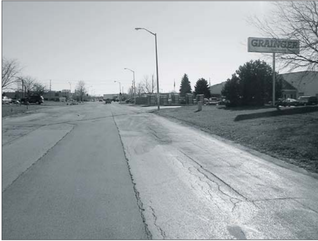
Before (shown here) and after photos (below) of a section of the Northbranch Industrial Park road...

treated with pulverization “are holding up well” with few if any cracking problems.