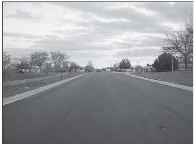
...the City of Oak Creek rehabilitated in 2007 using pulverization. The project also added curb and gutter elements.

maintenance cannot make a road last forever. They all face the need for rehabilitation sooner or later. Pulverization is a practical, reliable approach to restoring the worst roads—and one that, over time, reduces project impact on budgets and the environment. The experience of local governments across the state demonstrates pulverization is gaining traction as a better way to bring local roads back to life. GE