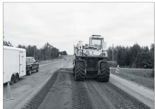
The pulverization process grinds and combines old asphalt layers with existing base materials to create a strong base for new overlay.

If a core sample includes subgrade soil, it confirms soil type and also answers the additives question. Does the mix of sand, clay, silt or other material create a firm or weak subgrade? If the latter, a stronger pulverized base and