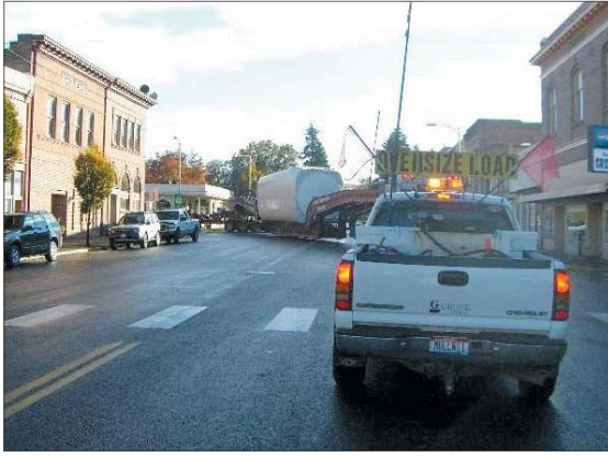
Dangerous curves: highly skilled Wilhelm truck driver negotiating through a tight spot.

transport; when assembled, a tower can weigh as much as 450,000 lb. Even the rotors are transportation challenges: Each wind blade is more than 60 ft long and weighs more than 12 tons.