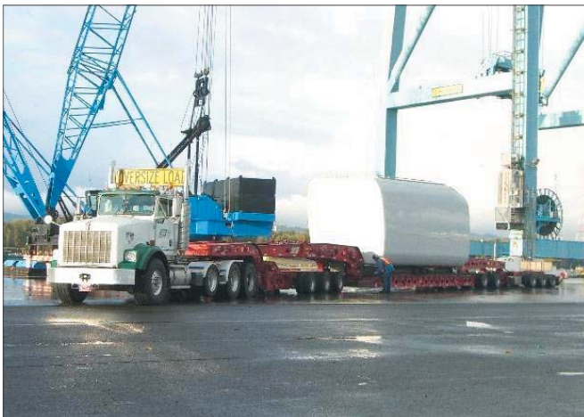
This 250,000-lb nacelle is prepared to embark on a 300-mile journey.

Transporting each nacelle requires a vehicle more than 220 ft long, comprising a truck, a jeep, a semi-trailer, a booster axle—another trailer—and a non-load-bearing truck. The tower, when erected, stands more than 220 ft tall. It splits into three segments for