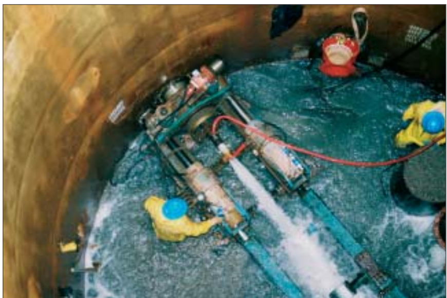
Workmen at one lateral in the caisson.

A contract for a second well was quickly issued to Collector Wells International. A subsidiary, International Water Consultants, Inc., conducted an extensive hydrologic evaluation and four exploratory wells before recommending a site located about 1,250 ft downstream from the first well. This newest well entered service at the end of 2005. Both units are designed for 25 mgd with a 48-mgd peaking capacity. The volume by these two units