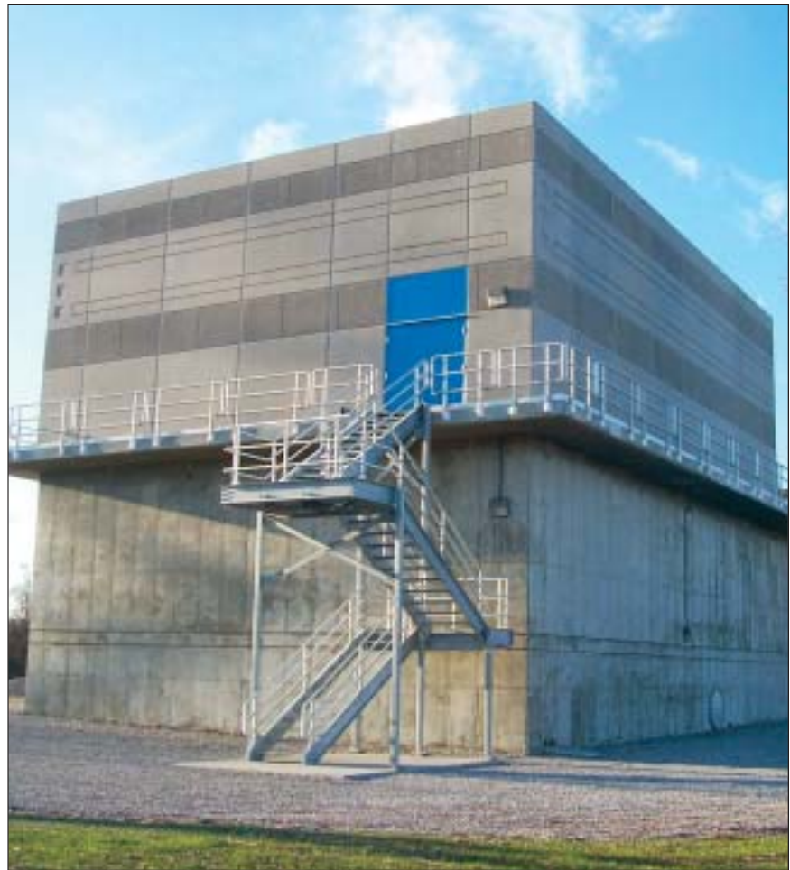
Shaft of the central caisson, which extends about 18 ft above grade to protect the well from flooding, is housed in a pump station.

The Missouri River crested at a record level of more than 48 ft on July 27 during the Great Flood as it muscled past the filter building complex at the Quindaro Water Processing facility. BPU-led crews battled in vain to save Filter Building #1, a structure comprised of segments built in 1910, the 1940s, and the 1960s. The swollen river eventually bore under the foundation,