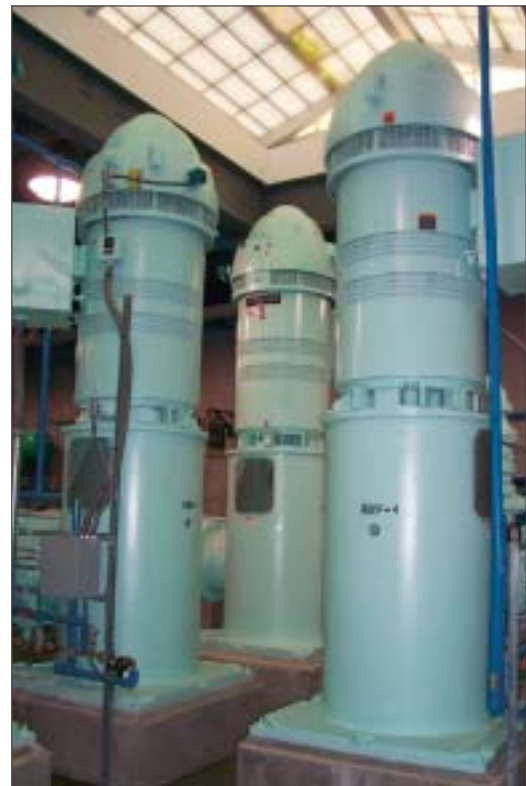
Working together the two collector wells can deliver nearly 100 mgd of water.

Black & Veatch ( www.bv.com ), BPU’s engineering consultants, studied the utility’s options in raw water sources