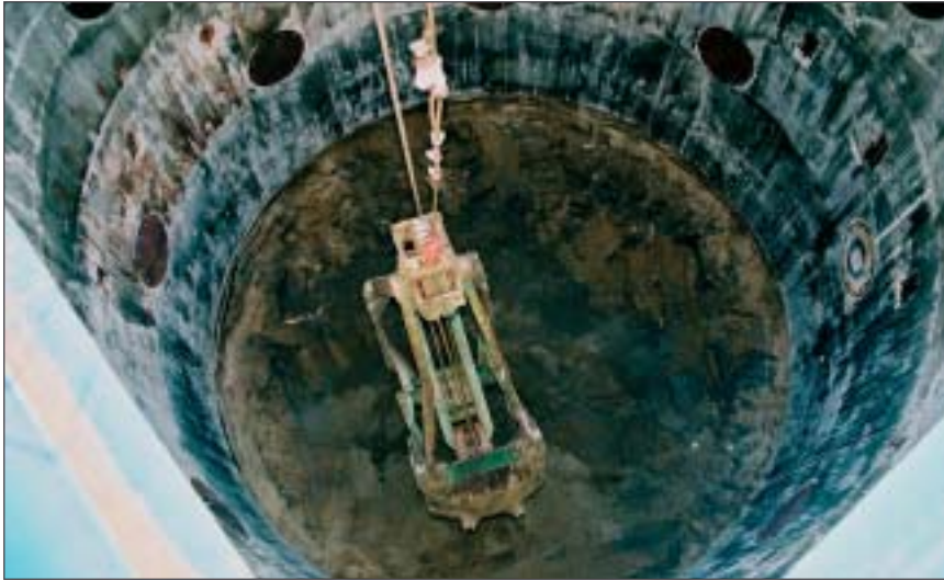
Caisson is poured in 12-ft increments following excavation for each segment.

for the replacement plant. The analyses compared the economic, tangible, and intangible benefits of surface intakes, traditional vertical wells, and the latest generation of horizontal collector wells.