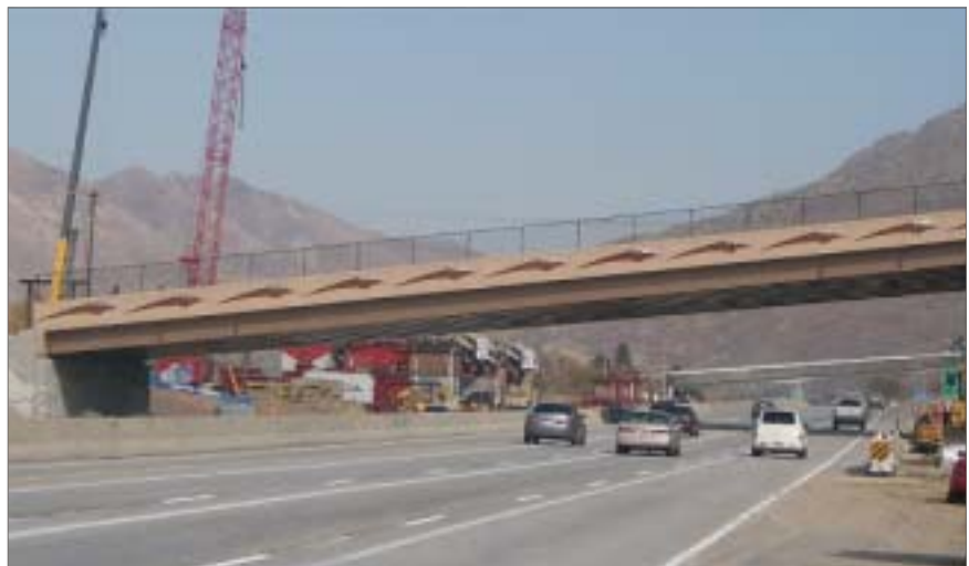
Following installation of the new bridge, I-215 reopened to traffic after a single weekend of work.