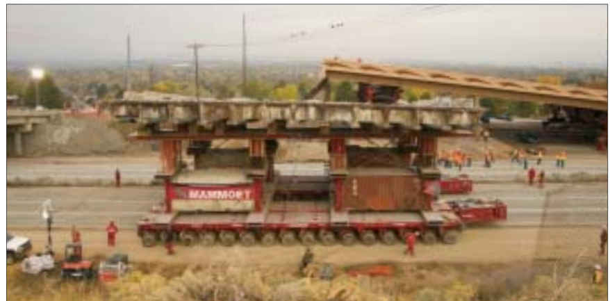
The Utah Department of Transportation used self-propelled modular transporters to remove the old 4500 South Bridge.

As part of the Highways for LIFE program and to provide a similar boost to