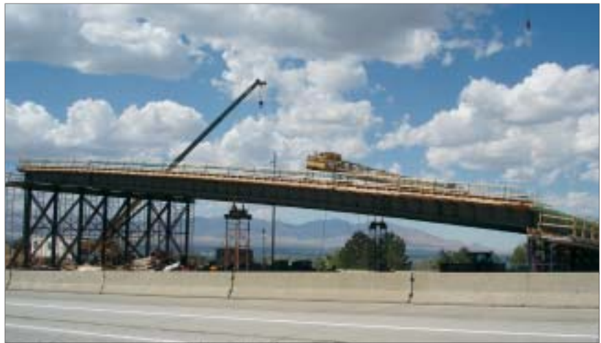
The superstructure of the new bridge was constructed offsite over a period of four months.