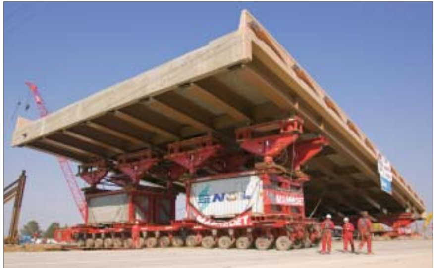
UDOT used SPMTs to install the prefabricated superstructure of the 4500 South Bridge in Salt Lake City in October 2007.

The preceding is excerpted from the December 2007 issue of Focus, and Issue 4, December 2007 of Innovator, both of which are published by the U.S. Department of Transportation, FHWA.