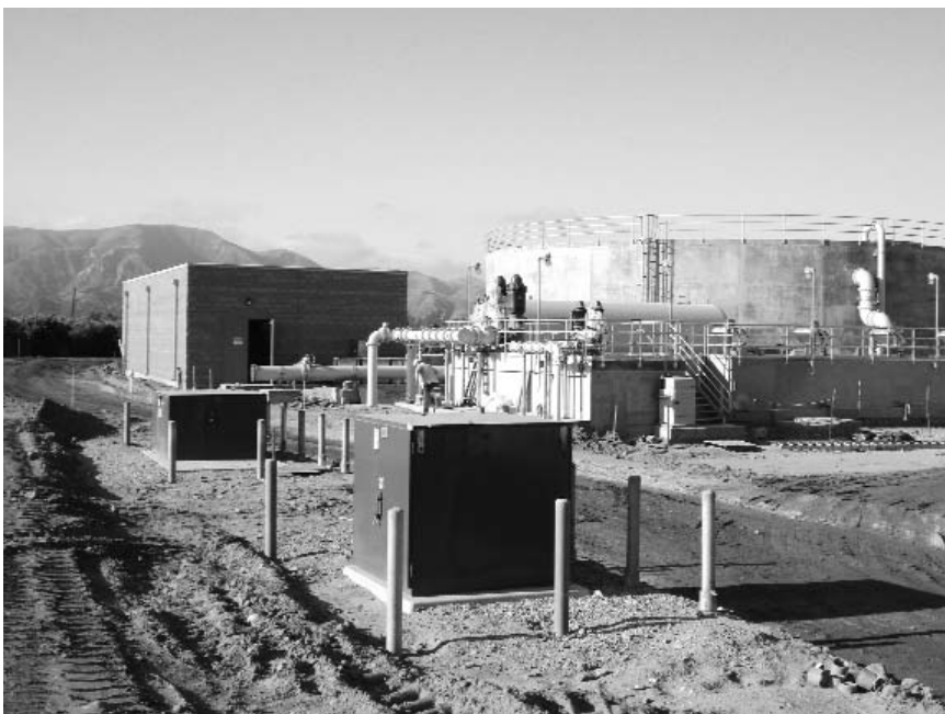
Construction view of the Fillmore Water Recycling Plant's one million gallon recycled water holding tank.

The new plant is yielding water ten times cleaner than other types of modern activated sludge plants, and this