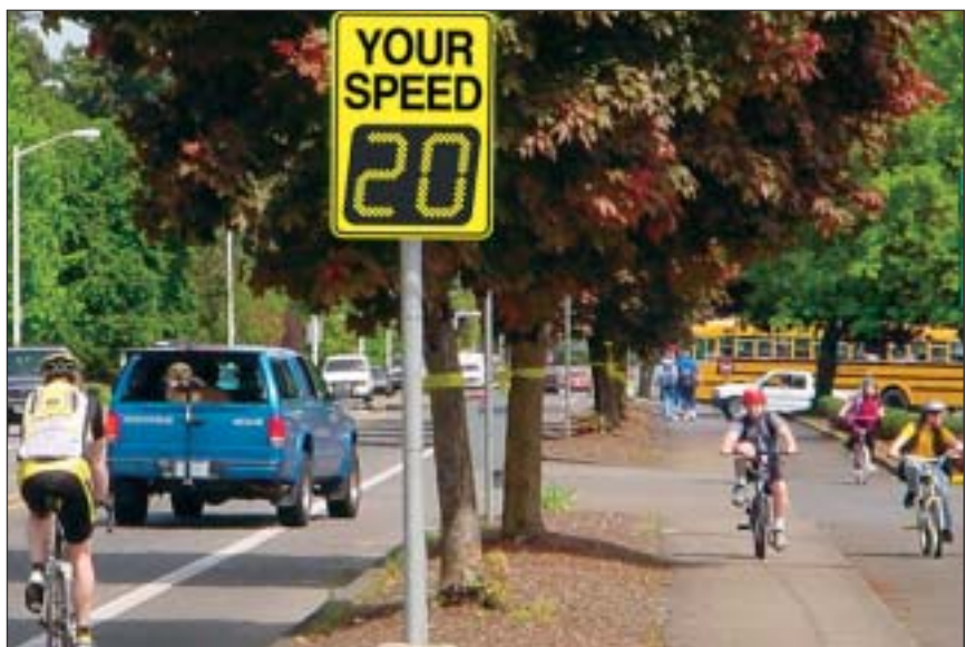
Traffic was almost immediately calmed and safety increased at Tigard High School following the installation of the electronic speed sign.

Tigard's municipal website, its monthly municipal newsletter, and the