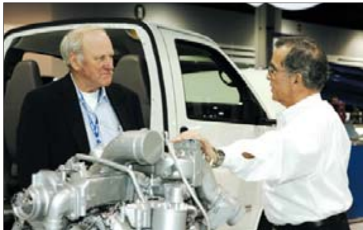
The Work Truck Show®, which is an excellent venue for meeting one-on-one with vocational truck and component manufacturers, includes The Green Truck Summit on March 3, 2009 in Chicago. For further information contact the National Truck Equipment Association at www.ntea.com .

But if the components aren't really needed, they're just taking up space and adding weight. For example, modern batteries and starters are much more efficient than they used to be, yet some purchasing managers still spec four cranking batteries when three would be adequate. The same idea applies to bypass oil filters and auxiliary oil coolers. Newer engine cooling systems and oil filters are more efficient than those of even a few years ago.