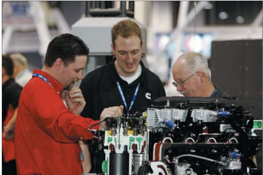
Technical advice and product information that's invaluable when specifying new vehicles is plentiful at The Work Truck Show®, which runs from March 4-6 in Chicago. For further information contact the National Truck Equipment Association at www.ntea.com .

Powertrain Optimization. The biggest opportunity for improving fuel economy is to properly spec the vehicle's powertrain. A properly specified powertrain ensures that the truck engine operates within its peak efficiency power band at all times (i.e., the engine's rpm is never below the maximum torque point and never above the maximum horsepower point, except during initial launch). Optimizing the powertrain for peak fuel efficiency is not as complex as it may seem. Truck dealers are equipped